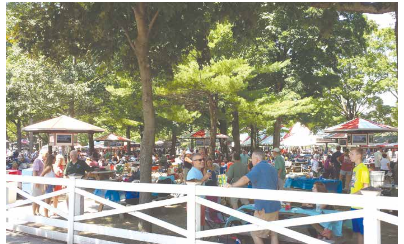
A longstanding tradition at the Saratoga Race Course, low cost seating out behind the paddock area is popular with people of all ages and incomes. It's a unique way to have a party! There is grandstand style seating in the Clubhouse as well. The annual Travers Stakes will be on August 26, 2017.