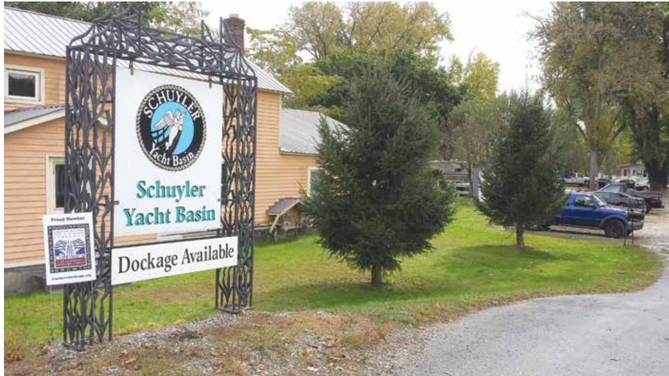
The entrance to the Schuyler Yacht Basin. www.schuyteryachtbasin.com , 518-695-3193, Saratoga's Harbor for many, many years.