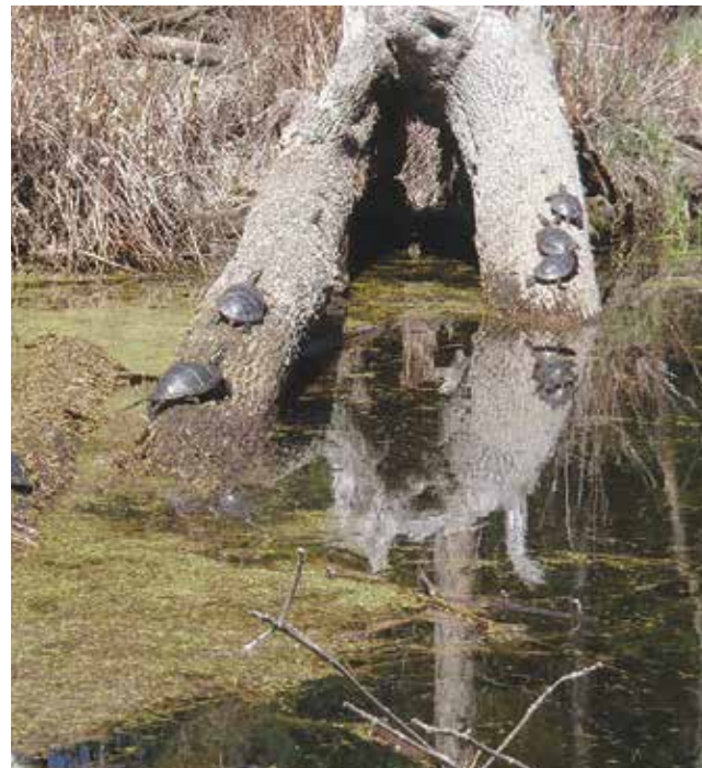
A popular spot for turtles to haul out and bask in the sun.

In our experience, every creek or small river we've paddled on that empties into the Hudson eventually reaches a "No More Mr. Nice Guy" point where it plunges/plummets dramatically, and you'd have to be a fool, have a Death Wish, or be really really