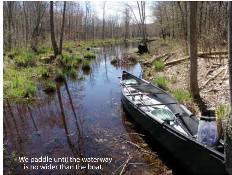
We paddle until the waterway is no wider than the boat.