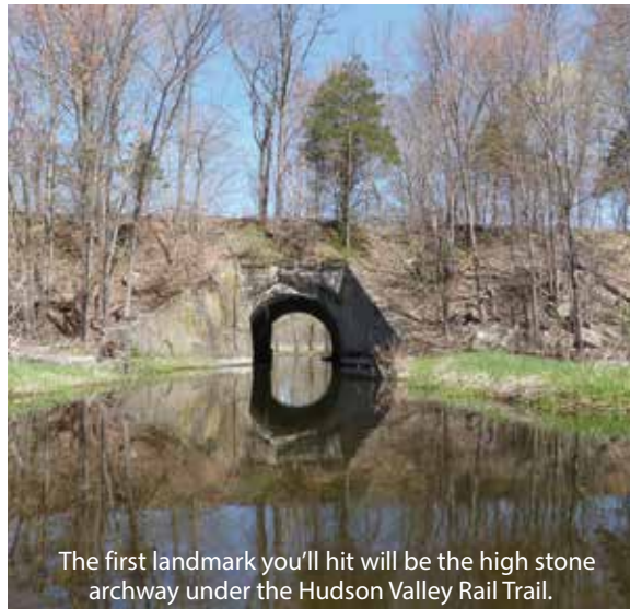
The first landmark you'll hit will be the high stone archway under the Hudson Valley Rail Trail.