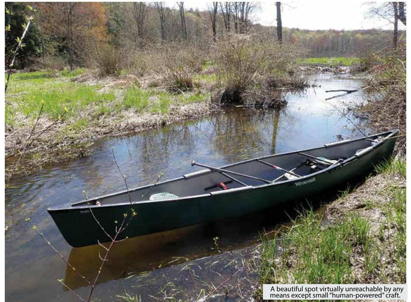
A beautiful spot virtually unreachable by any means except small "human-powered" craft.

You eventually reach a point where the creek takes a pretty abrupt left turn and narrows dramatically, dropping under a wooden walking bridge. We once dealt with this short, nasty little boat-bottom scratcher, but there's an unnavigable waterfall a short ways beyond, and it's not worth the energy and effort for us to deal with this; this is where we now typically turn back to the New Paltz Road; ummmm, FYI you'll