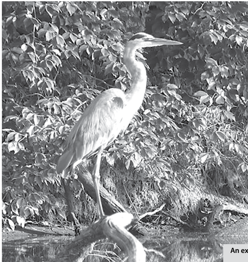
An example of the beautiful wildlife on Saratoga Lake.

restrictions apply), it transforms into a pristine, quiet setting with only paddles making rippling sounds, birds flying overhead and other wildlife surrounding the observer.