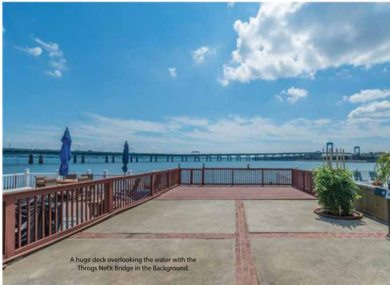
A huge deck overlooking the water with the Throgs Neck Bridge in the Background.

Every once in a while a unique residence comes on the market that is perfect for someone, or a couple that is looking for: A home facing east, with access to the water, in a quiet neighborhood, as well as mass transit nearby to get you anywhere you wish to go.