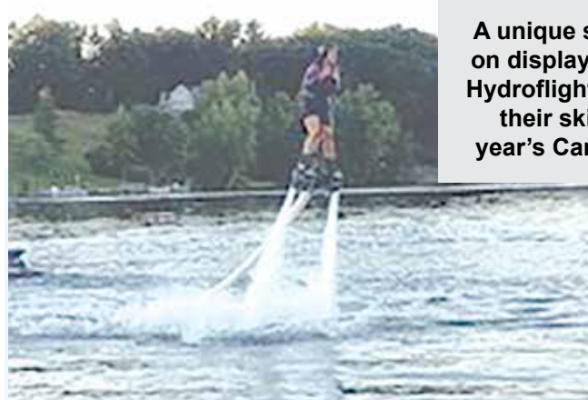
A unique sport will be on display as Extreme Hydroflight showcases their skills at this year's Canal Festival.