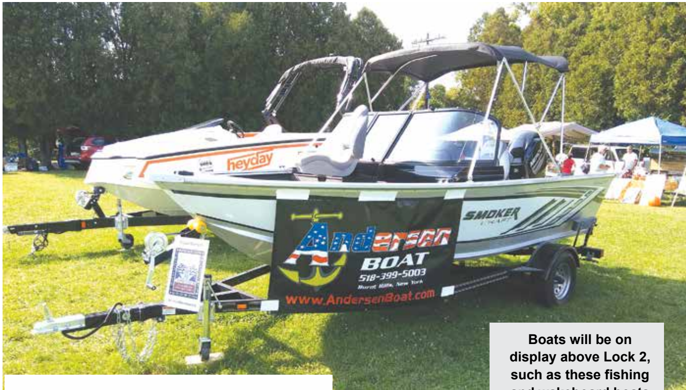
Boats will be on display above Lock 2, such as these fishing and wakeboard boats sold by Andersen Boat of Burnt Hills, NY.