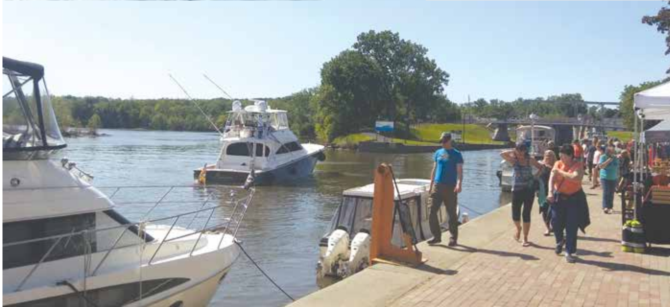
Boats of all sizes and ports of origin will pass by during the Canal Festival on their journeys through our inland waterways. Here a large, blue sportfisherman is waiting to enter Lock E-2 and return to its homeport of Cleveland, OH.