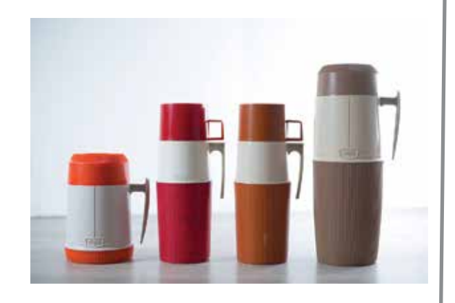
Hot chocolate for chilly days.