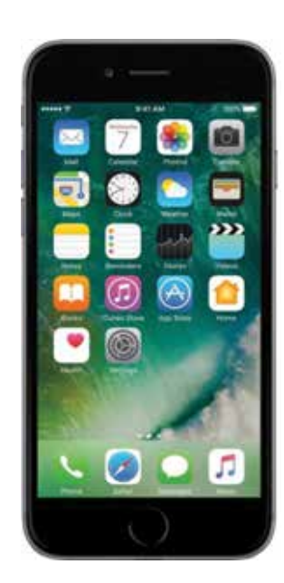
Always take your phone in case of an emergency.

Pack away a tape measure even if you just size up a six inch sunny and be sure to have a net at the ready for not only fish but maybe the extra joy of frog and turtle bonus "catches" that can salvage a fishless day into a treasure of alternative biological wonders. If you use a light, long