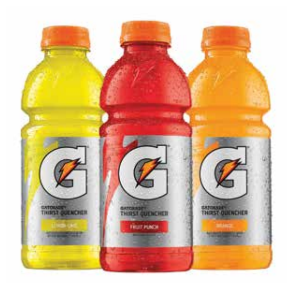
Bring lots to drink.

license and rulebook for the involved adults so they know exactly what they can and can't do in the state they are angling in. Buy the year long choice because it's the best bang for your buck and supports the state hatchery programs and other worthy aspects of the stocking programs. Bring along both your cell phone and camera or video back-up for unforgettable irreplaceable mementoes of your child's first catch, a screaming face holding a squirming worm, or a deep grateful hug from the happiest kid in the world!