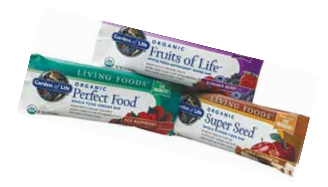
Kids want snacks.

More basic essentials include a lunch or bunch of preferred snacks (food bars or fruit) depending on the duration of the trip, plus plenty of liquids that the child likes. In the hot summer a Gator Aid electrolyte replacing type drink is great, while in cold weather a thermos of hot chocolate might be the perfect choice. It's vital that little kids be hydrated; especially when they are excited and distracted with energizing angling activities that make them perspire and burn up so much energy.