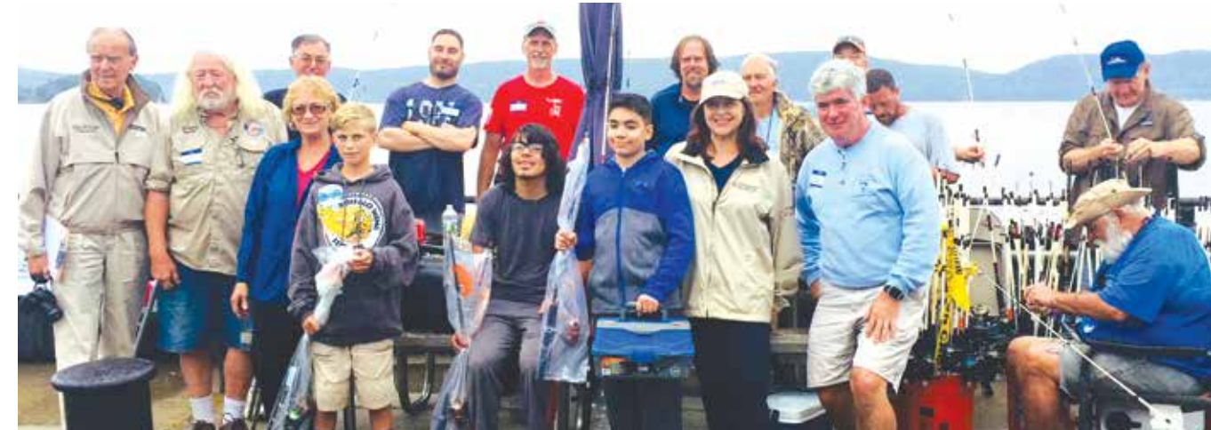
The Hudson River Fisherman's Association, winners, and volunteers are key to the success of the Croton Yacht Club River Day. The hundreds of fishing rods, reels, bait, a most importantly, the expertise that this group brings to events such as this is unprecedented. Each volunteer works with total strangers, usually parents and their children who have never fished before to keep the cild engaged long enough for them to catch a fish. "Catching a fish" is key to the success of this group and they are experts at it!