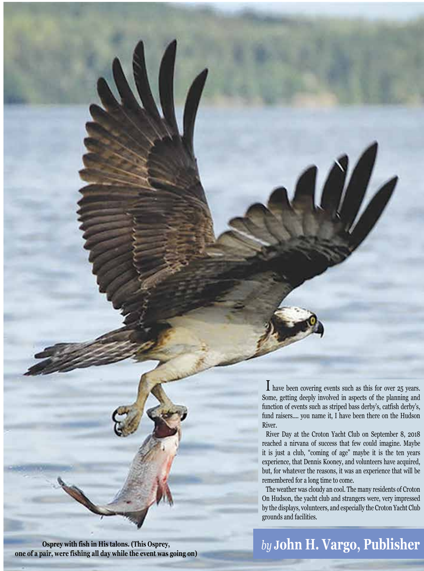
Osprey with fish in His talons. (This Osprey, one of a pair, were fishing all day while the event was going on)

I have been covering events such as this for over 25 years. Some, getting deeply involved in aspects of the planning and function of events such as striped bass derby's, catfish derby's, fund raisers.... you name it, I have been there on the Hudson River.