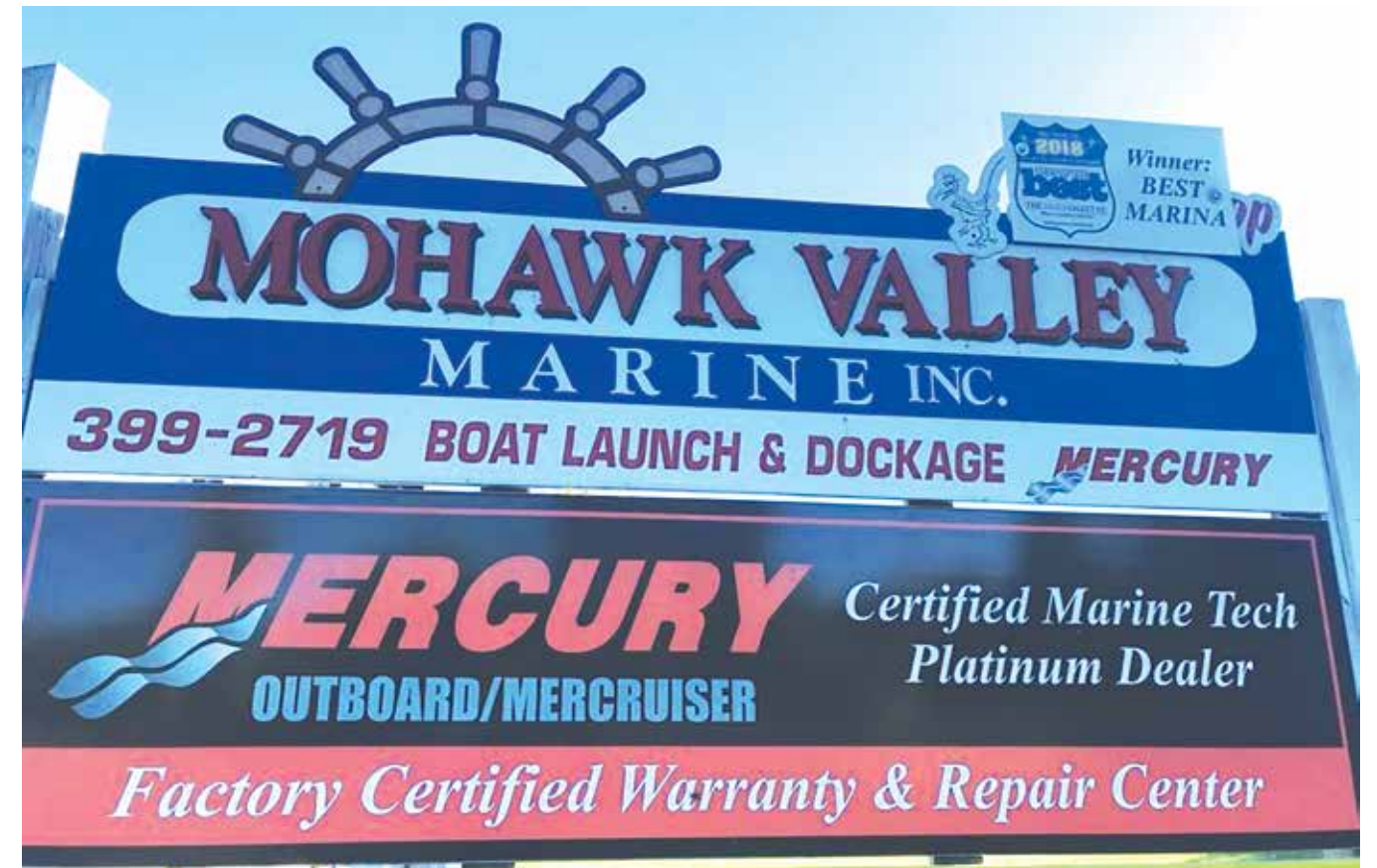
This sign welcomes visitors to Mohawk Valley marine, in Alplaus,