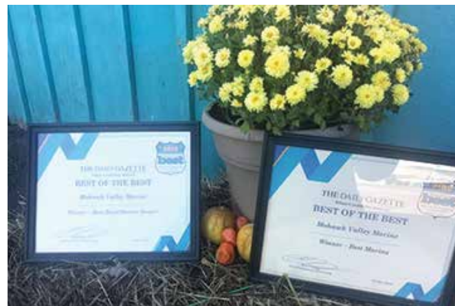
They competed for a mere certificate, but display it proudly at Mohawk Valley Marine, recognized among the best of its peers for 2019 by the Daily Gazette of Schenectady.

Mohawk Valley Marine is a great example of the family-owned, dedicated marine service businesses found all along the Erie and Champlain Canals in Albany, Rensselaer, Saratoga and Schenectady Counties. For more information on area marine resources, call (518) 371-3763, visit www.southernsarotoga.org or stop by the Southern Saratoga Information Center (at the Exit 9 Rest Area on I-87).