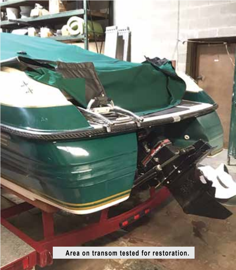
Area on transom tested for restoration.

A boat built with polyester resin is the most affordable and lightest. A diligently well maintained boat can look good and last many years! I can attest to that as I have worked on many older nice looking boats through the years.