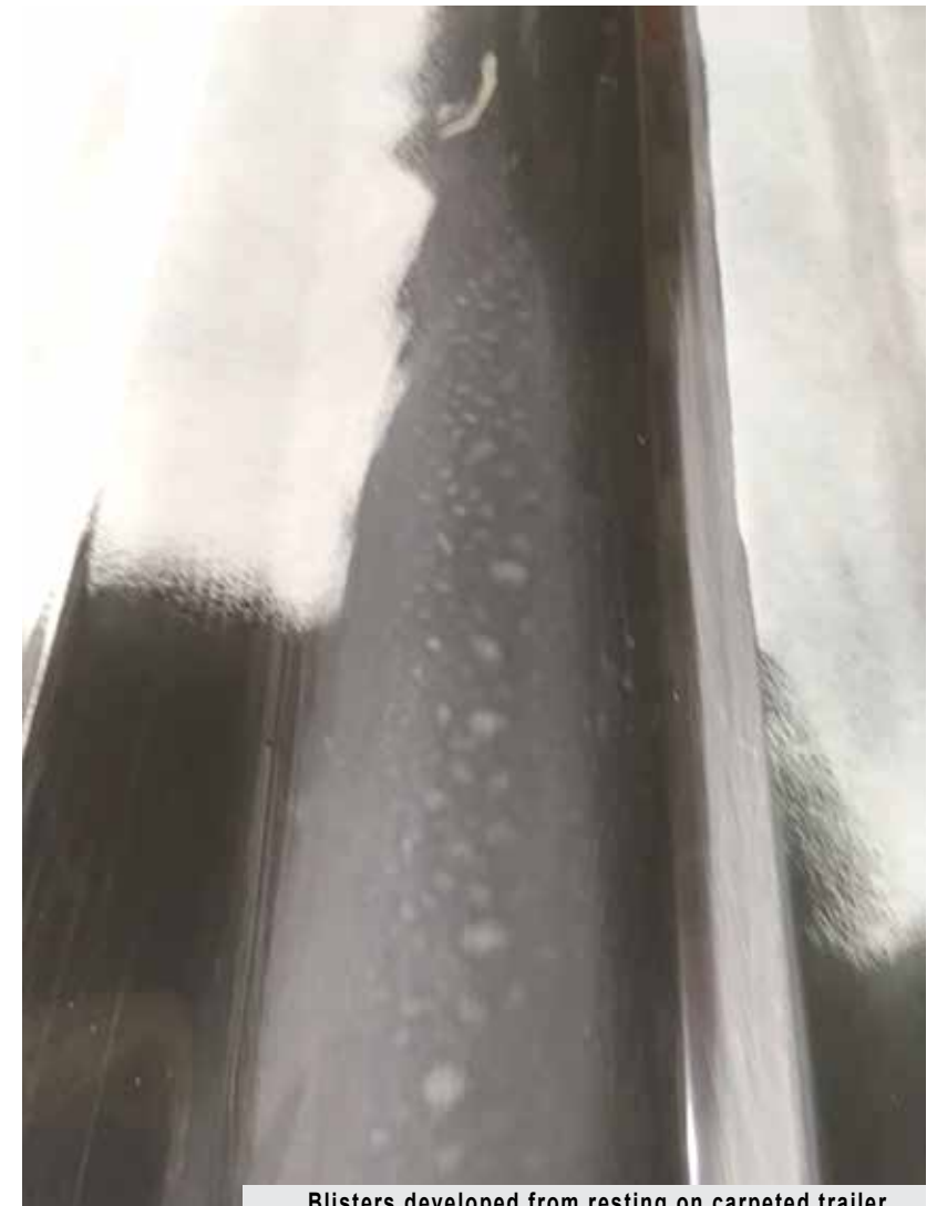
Blisters developed from resting on carpeted trailer bunk- Blisters hidden from view.

Buying a new boat? Do your homework and ask what the manufacture warranty is on the hull. "Read the small print" as Manufacturer warranties vary. Warranty from a well known manufacturer stated "EXCLUSIONS: Notwithstanding anything herein to the contrary, this Warranty does not cover or include: Gel coat surfaces, including but not limited to: cracking, crazing, discoloration, fading, oxidation, or blistering." There are some manufacturers building new boats delivered with a barrier applied at the factory, and may even include a 5 or 10 year blister warranty. It is important to note that you may have to treat the