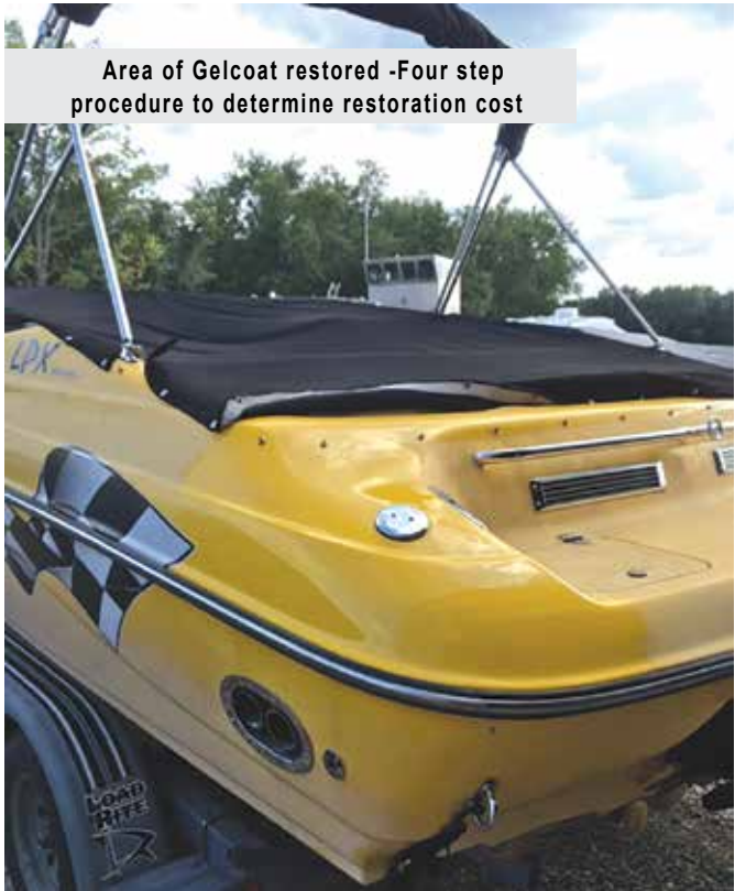
Area of Gelcoat restored -Four step procedure to determine restoration cost

Email your questions to- boatrepair@aol.com we'd be happy to help! Next Issue - More Questions from our readers!