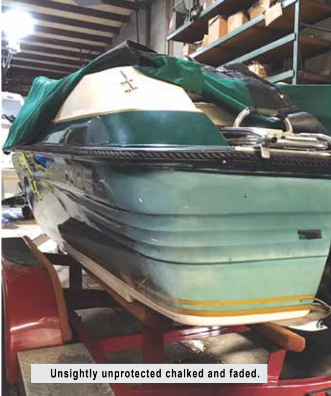
Unightly unprotected chalked and faded.