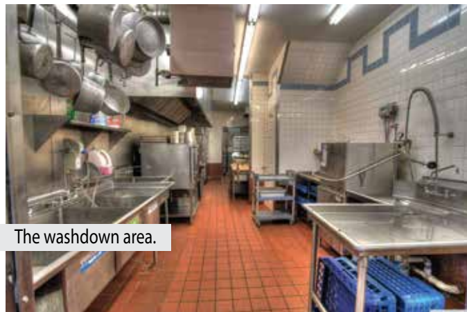
The washdown area.