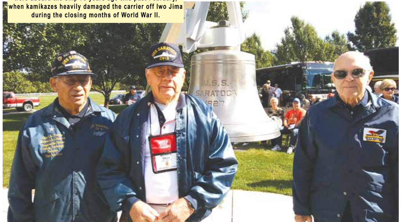
The ship's bell of one of America's most storied aircraft carriers, the USS Saratoga (CV-3) is on display just a short bicycle or Uber ride from the docks in Schuylerville. The three men pictured in this photograph were aboard the ship 75 years ago this past February, when kamikazes heavily damaged the carrier off Iwo Jima during the closing months of World War II.