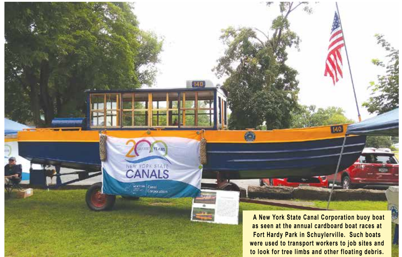
A New York State Canal Corporation buoy boat as seen at the annual cardboard boat races at Fort Hardy Park in Schuylerville. Such boats were used to transport workers to job sites and to look for tree limbs and other floating debris. Originally, they were used to service and refuel lighted buoys back in the days of oil lamps

From the New York State Canal Corporation Facebook Page: “Social Distancing will help flatten the curve of Covid-19, but you can still head outside to get some Vitamin D – Governor Andrew Cuomo has waived all state and local park fees. Be sure and check out the vast NYS Trail System with many trails along the Erie Canalway National Heritage Corridor.” Boating is not only a robust outdoor activity, its also a way to stay safe and be healthy, even in a national crisis!