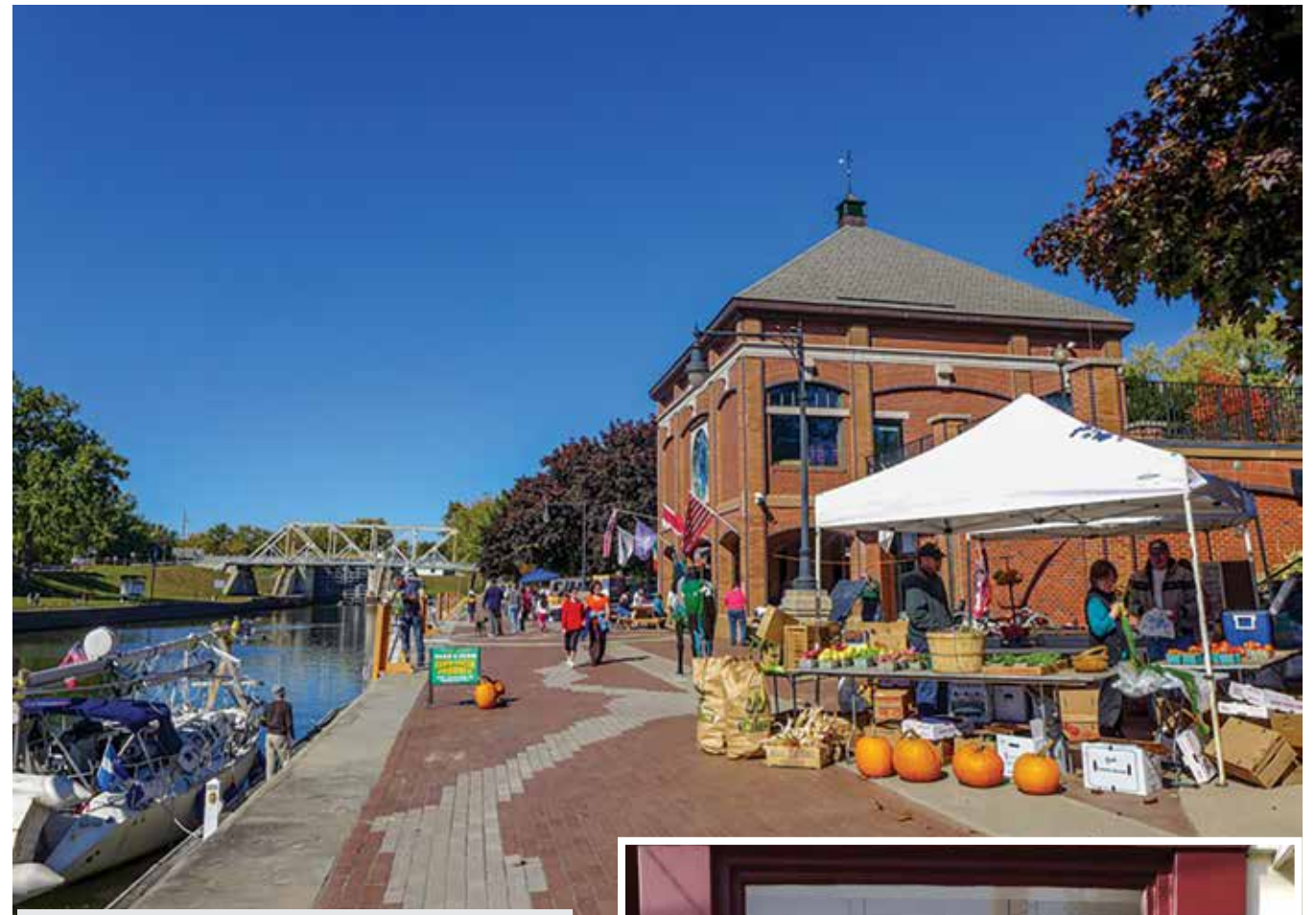
Visitors to Waterford's harborfront on Sundays from 9am-1pm will be docked right in the middle of the Waterford Harbor Farmer's Market. Area farmers and artisans have fresh produce, meats, maple and hickory products, and numerous crafts on display, plus live music and more.

A short walk away are village businesses such as Irresistible Nutrition (53 Broad Street), a wonderful new spot for tasty and nutritious shakes, smoothies, teas and juices. Owner Bianca Jerian