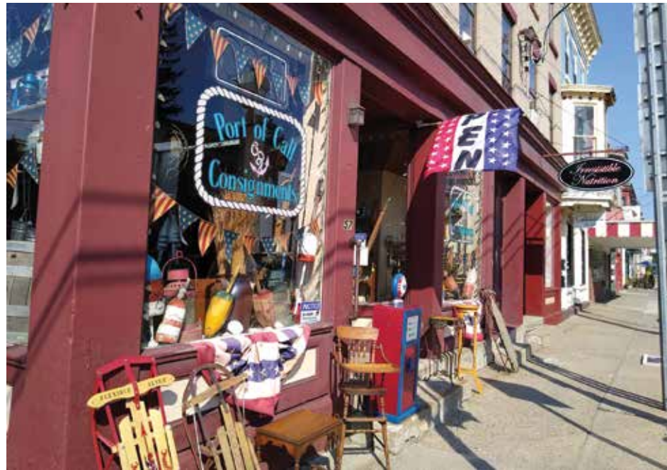
Cute storefronts such as these await the visiting boater in Waterford. Port of Call Consignments has everything from vintage Flexible Flyer sleds to used fishing reels, rods, lures, tackle boxes and other equipment, in addition to numerous consignment items. Be sure to stop in and tell owner Rich Bronk that we sent you!