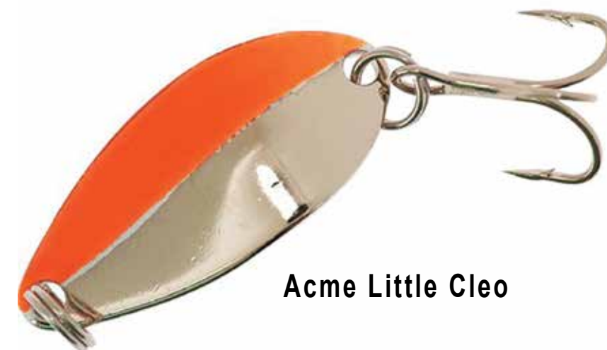
Acme Little Cleo

I saved the best spoon for last in my opinion because it has caught me thousands of pounds of salmon over the years! I am referring to the very round and heavy Little Cleo made by Acme the same folks who also made the Kastmaster. While it can also fool blues and stripers as a bunker imitation, Cleos are a lethal alewife replica that gets salmon on the troll, in the rivers on their redds( spawning beds), and just about any time you can put one in front of the other! ¼ Oz. Blue silver Cleos with glow ladderback tape is deadly at night where this is legal and during the day time any color that will piss off the salmon that day is the right call.