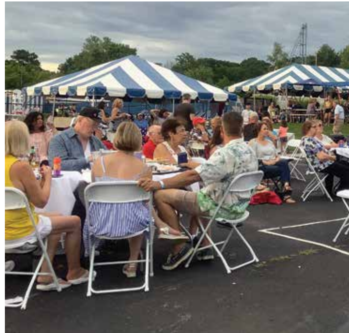
Part of the large crowd just below the Cove Café in background