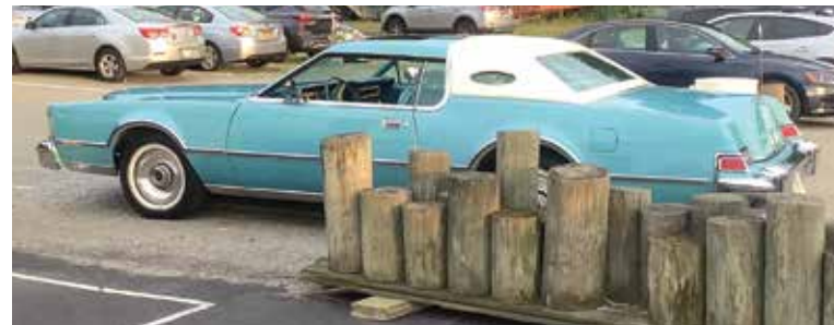
Elvis's car, a show piece in itself