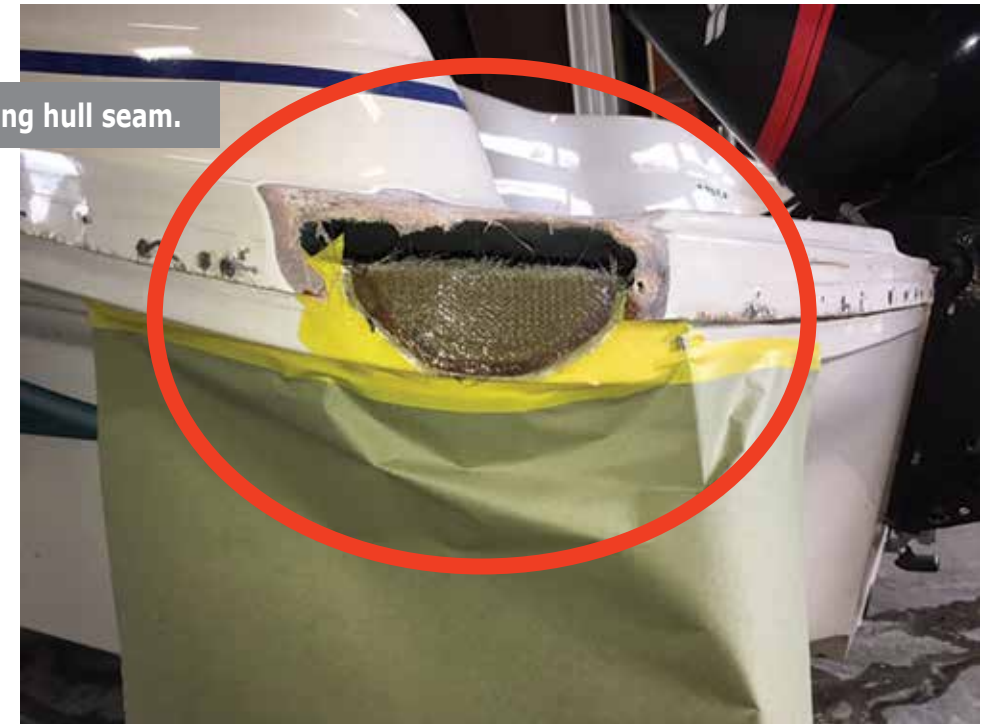
Damage from crash.

Our customer, owner of this beautiful pristine 1998 Sea Ray and his family were on their stopped boat floating and enjoying a nice day in the middle of the lake. All were on board, mom, dad and kids were sitting in the stern area. The family then got up and moved towards the front of the boat never expecting what was about to happen! Along came airhead "Joe Schmoe" driving his boat towing a skier. The driver pulling the skier along with the spotter (Observer)