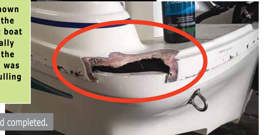
Hull seam rebuild completed.

The boat damage shown in these photos is the result of a negligent boat driver! He was totally unaware of where the boat he was driving was headed as he was pulling a water skier!