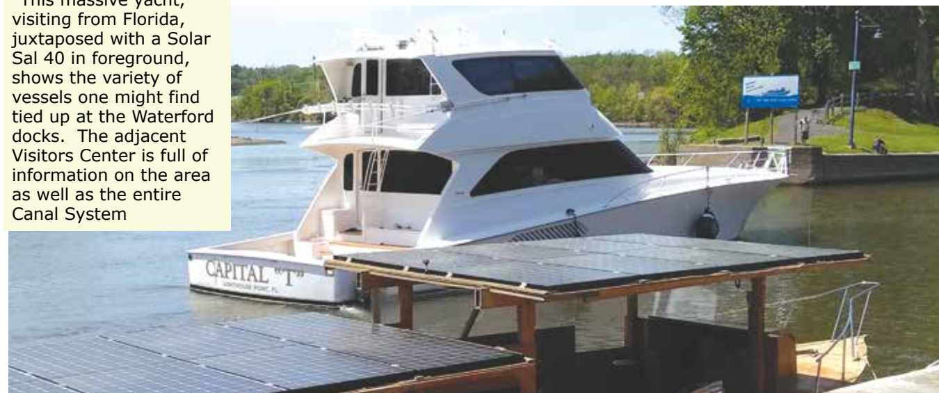
This massive yacht, visiting from Florida, juxtaposed with a Solar Sal 40 in foreground, shows the variety of vessels one might find tied up at the Waterford docks. The adjacent Visitors Center is full of information on the area as well as the entire Canal System

and an opportunity to see the Canal in operation. This year, solar-electric boat pioneer David Borton will showcase his new 24' Solar Sal model, notable because it is his first creation in fiberglass, designed for easy maintenance, and optimized for its solar-electric powerplant that eliminates the need for fossil fuels to propel the boat.