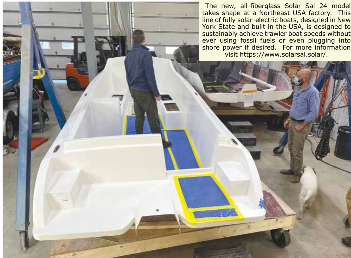
The new, all-fiberglass Solar Sal 24 model takes shape at a Northeast USA factory. This line of fully solar-electric boats, designed in New York State and built in the USA, is designed to sustainably achieve trawler boat speeds without ever using fossil fuels or even plugging into shore power if desired. For more information visit https://www.solarsal.solar/ .

a tugboat pushing a barge to a facility somewhere in the interior of New York State, the Great Lakes or Canada.