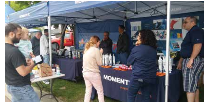
Industry has thrived along the Hudson River's shores for centuries. Momentive Performance Materials in Waterford ( www.momentive.com ) has moved to specialize in space-age, high performance silicones in recent years, helping provide the technology needed to put Americans in space for ambitious journeys, improve aviation, and a whole host of important manufacturing uses.