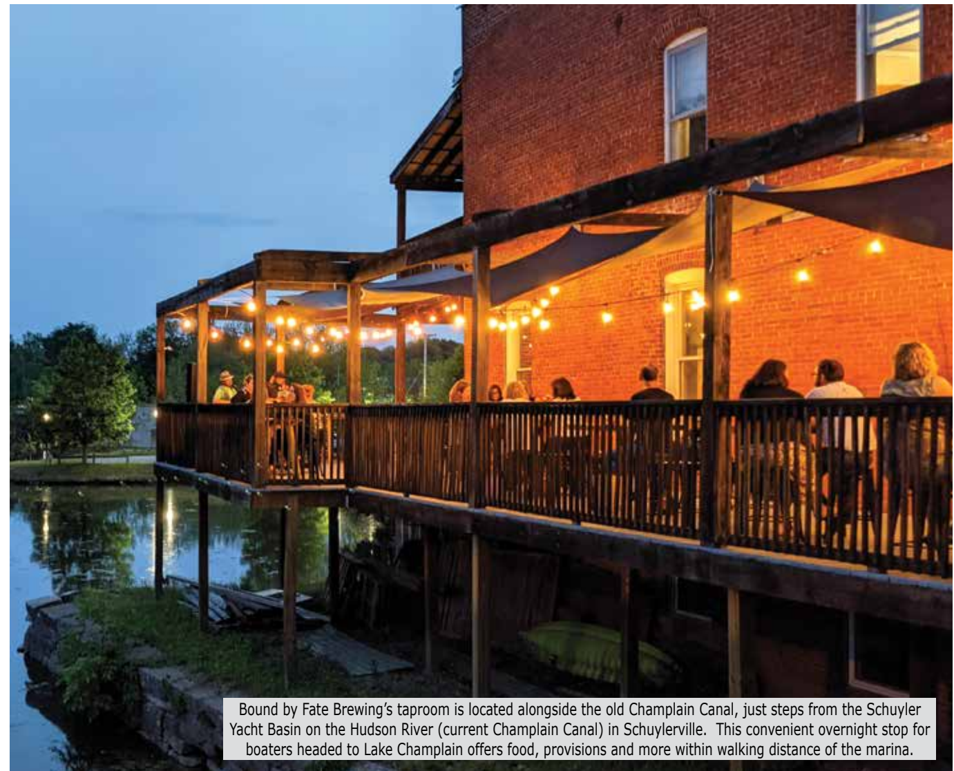
Bound by Fate Brewing's taproom is located alongside the old Champlain Canal, just steps from the Schuyler Yacht Basin on the Hudson River (current Champlain Canal) in Schuylerville. This convenient overnight stop for boaters headed to Lake Champlain offers food, provisions and more within walking distance of the marina.