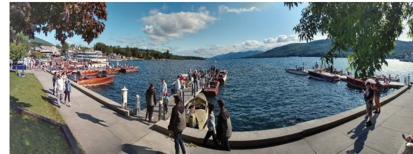
Lake George Wooden Boat Rendezvous 2019

Later in July I might go retrieve them and bring them to the Meet in August to raffle off. Not sure exactly how I want to handle this and am open to suggestions, but the proceeds, if any would go to our chapter's kitty.