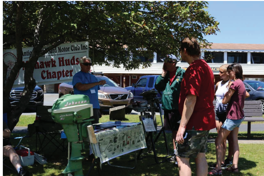
The MH Chapter Booth at the Fulton Chain Wooden Boat Rendezvous in Old Forge, NY July 9, 2022.

Schroon Lake will be out last scheduled event, on September 25 th at the Schroon Lake Town Boat Launch. As in the past, start at 9 am, end at 2 pm with coffee and donuts in the AM and Pizza from DeCesare's for lunch. We can have more events, but I'd need a volunteer to help with it if we do. Five so far is our most aggressive to date, but that works with good help!