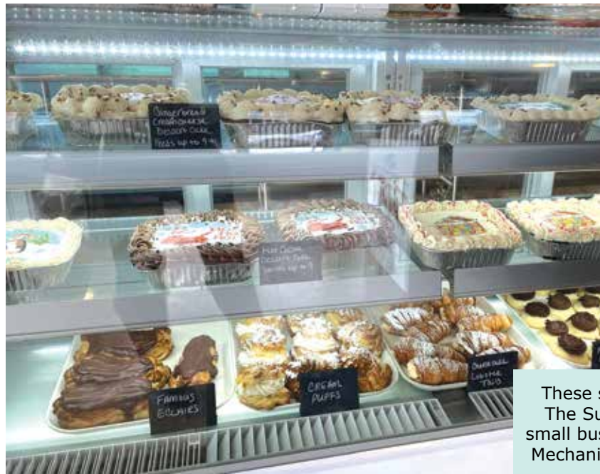
These sweet treats and more await visitors to The Sugar Fairy Bakes, LLC, one of the great small businesses along Park Avenue in downtown Mechanicville, about ¼ mile from the City docks

8am-3pm. Incidentally, those towing their boats upstate via I-87 will find The Sugar Fairy Bakes' second location in Malta at Exit 12.