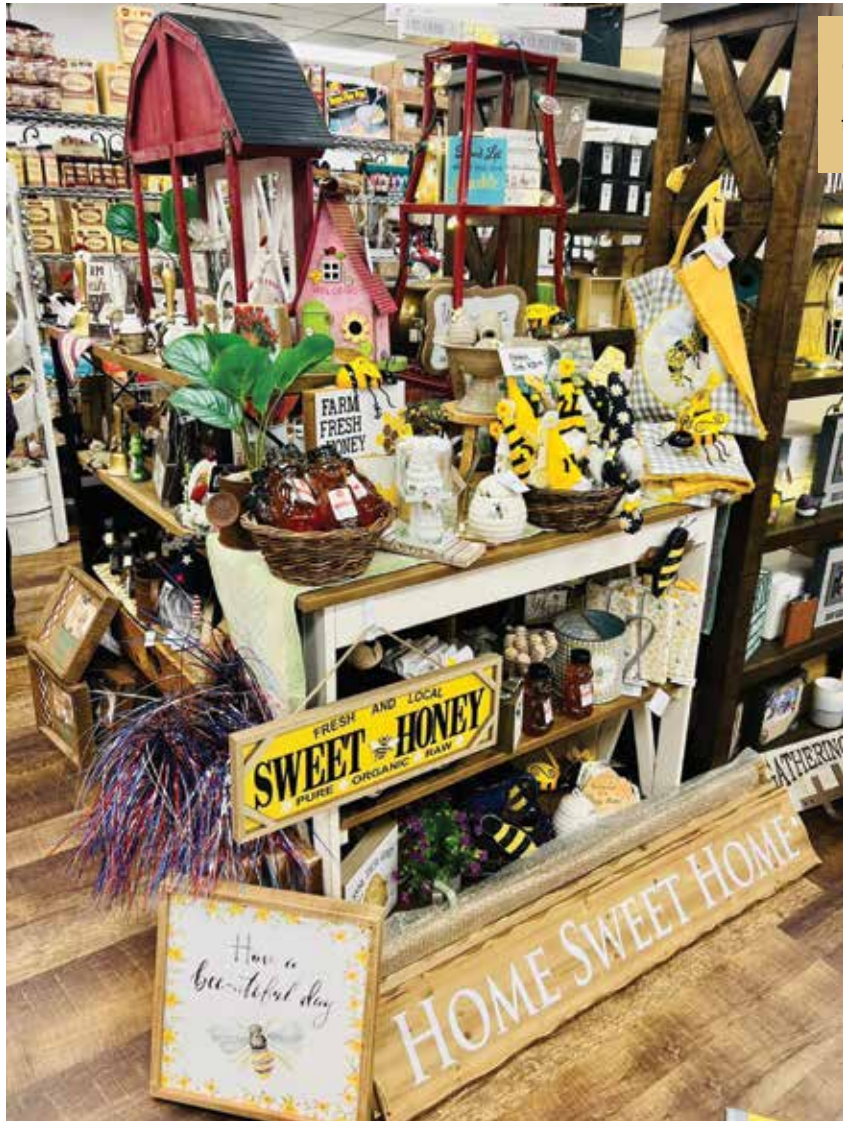
Park Avenue Confectionary, LLC & General Store is a must-see on any stop in Mechanicville. Interesting gifts and trinkets, plus gourmet food items and of course candy!

a shame because there is a lot to see and do and also some great culinary treats to enjoy if one sets aside enough time for a side trip during their canal voyage this summer.