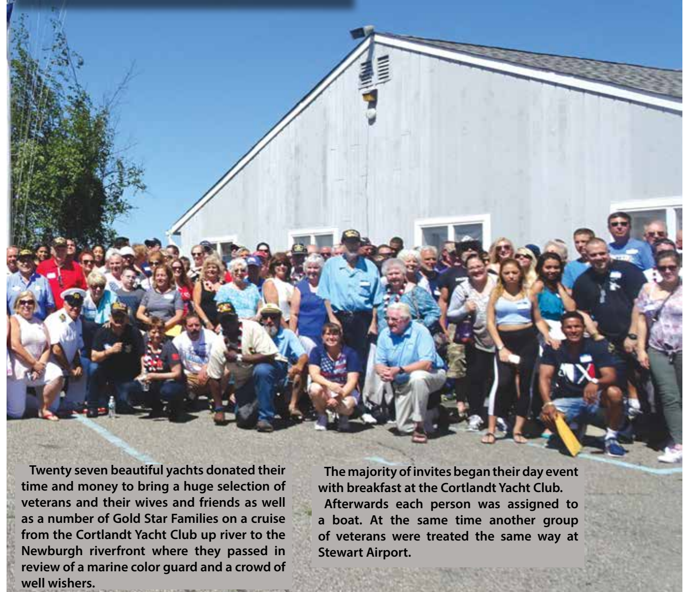
Twenty seven beautiful yachts donated their time and money to bring a huge selection of veterans and their wives and friends as well as a number of Gold Star Families on a cruise from the Cortlandt Yacht Club up river to the Newburgh riverfront where they passed in review of a marine color guard and a crowd of well wishers.