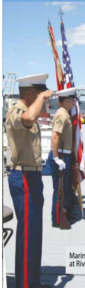
Marines in salute to fleet of boats at Riverfront Marina