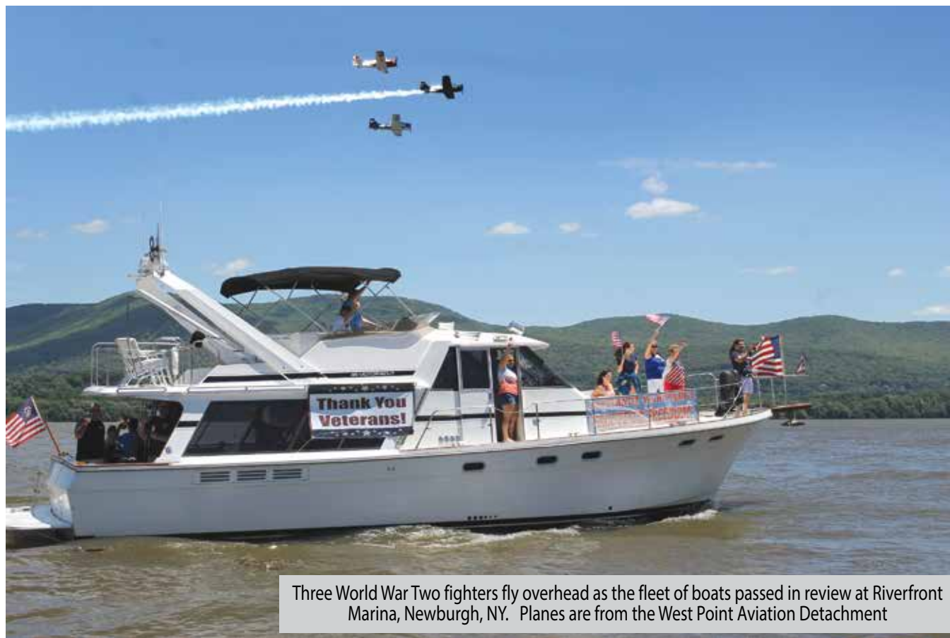
Three World War Two fighters fly overhead as the fleet of boats passed in review at Riverfront Marina, Newburgh, NY. Planes are from the West Point Aviation Detachment