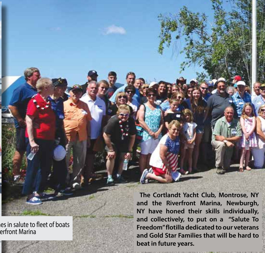
The Cortlandt Yacht Club, Montrose, NY and the Riverfront Marina, Newburgh, NY have honed their skills individually, and collectively, to put on a "Salute To Freedom" flotilla dedicated to our veterans and Gold Star Families that will be hard to beat in future years.