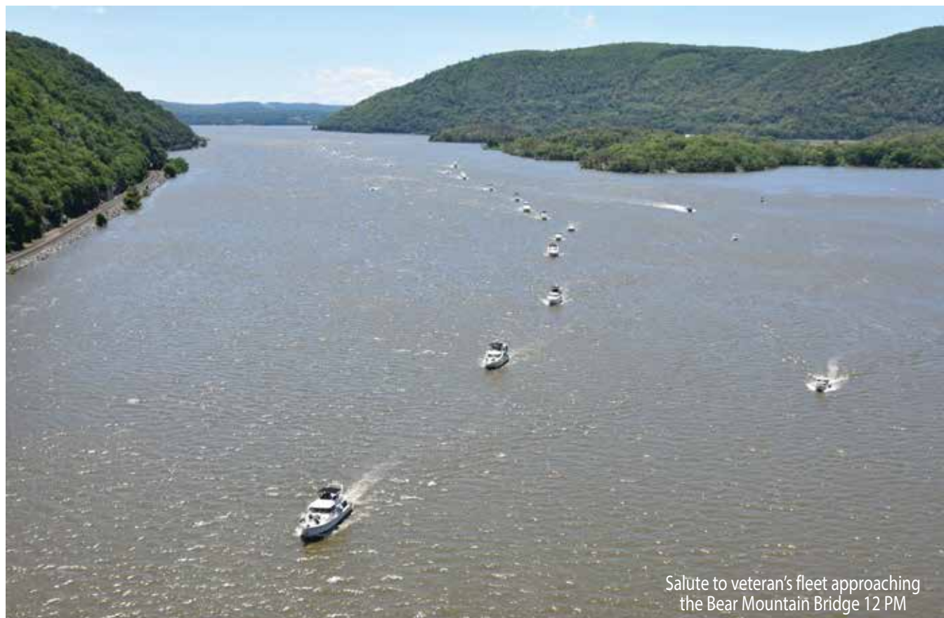
Salute to veteran's fleet approaching the Bear Mountain Bridge 12 PM