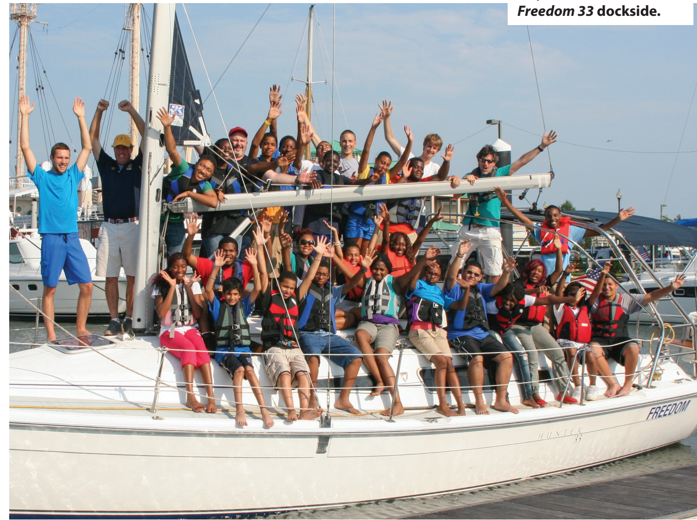
City Sail Kids aboard the Freedom 33 dockside.

boatingonthehudson.com boatingonthehudson.com 36 Holiday Issue 2012 Holiday Issue 2012