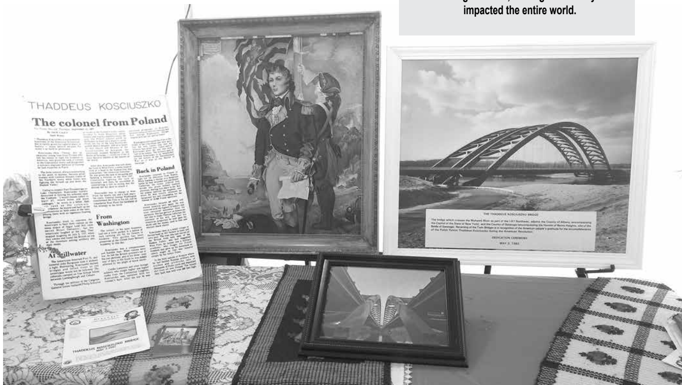
The work of Thaddeus Kosciuszko is evident throughout the region from Waterford to Ticonderoga. The Polish Colonel tried to convince leaders to fortify Ft. Ticonderoga, when he was rebuffed he concentrated on Waterford and Saratoga instead, leading to a victory which impacted the entire world.