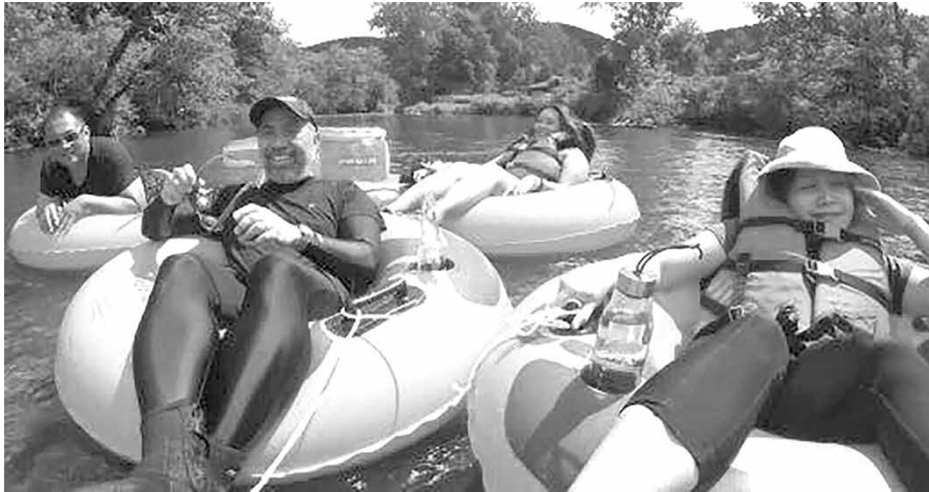
Groups of eager tubers visit Big Big on the Battenkill in southwestern Vermont, accessible via arranging transportation from southern Saratoga County ports of call. The owners of this fun attraction also operate South Shore Marina on Saratoga Lake for trailer boaters, adjacent to Nostalgia Wine Bar and Ale House, in Malta, NY.