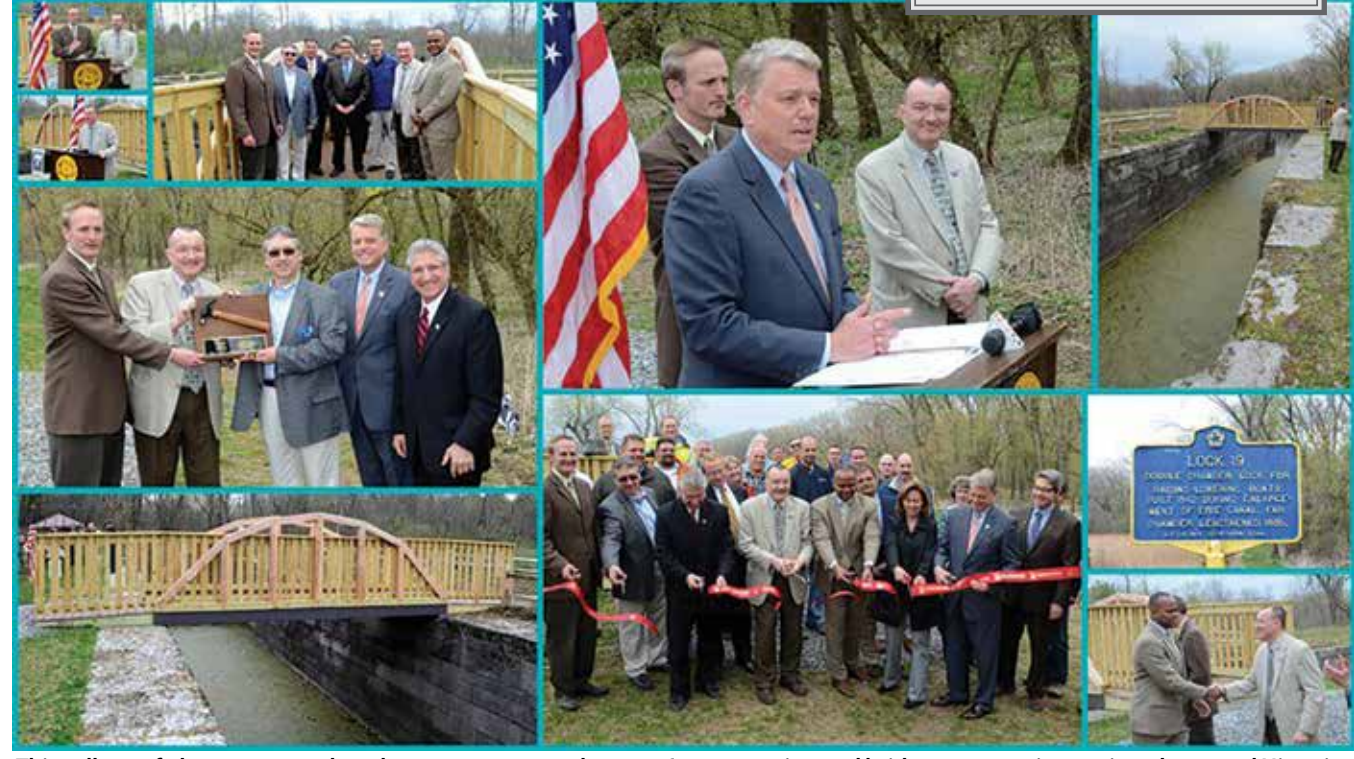
This collage of photos was produced to commemorate the 2012-'13 renovation and bridge construction project that saved Historic Lock 19 and was recognized with a major collaborative volunteerism award.