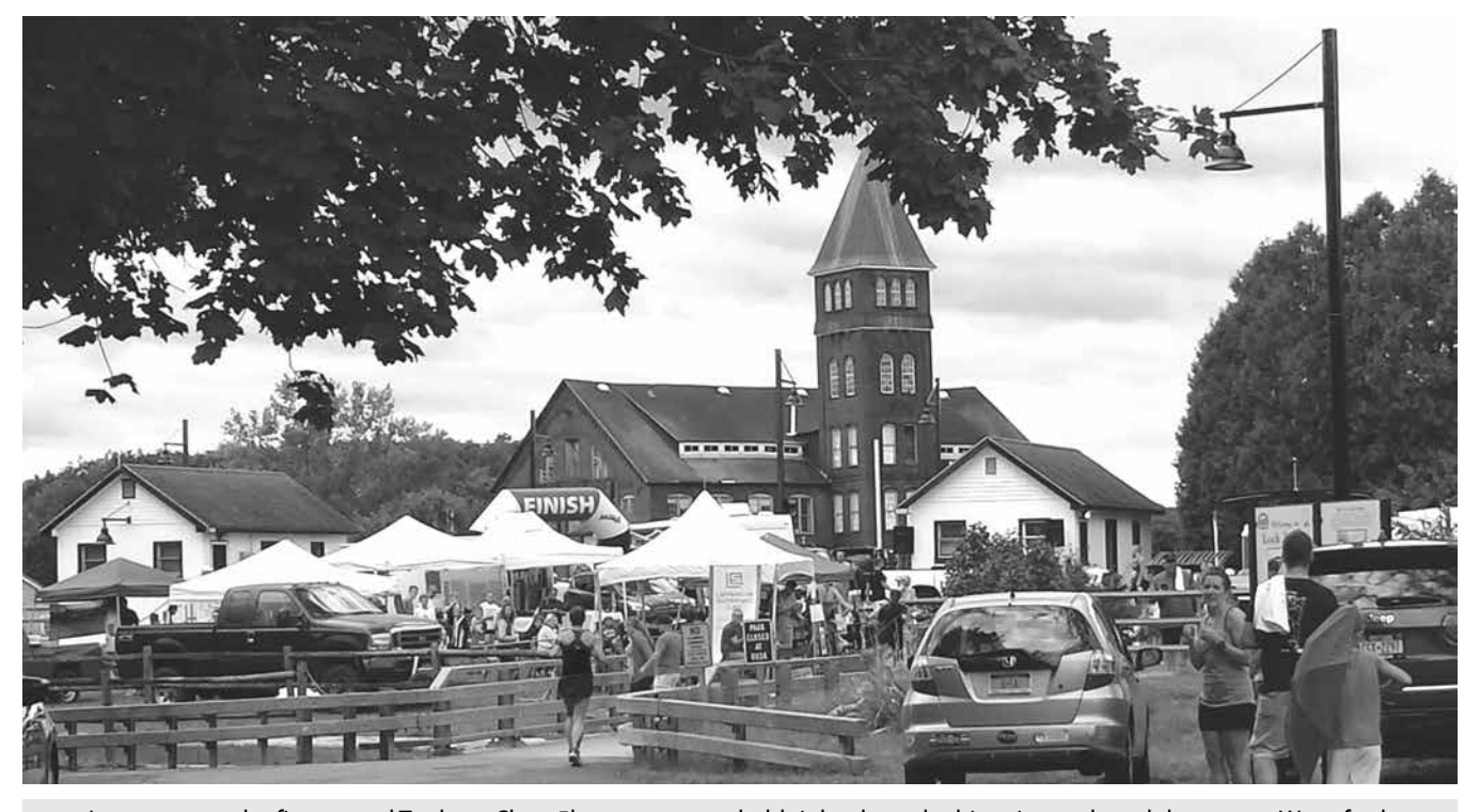
Last year was the first annual Tugboat Chug 5k, a great event held right along the historic canals and downtown Waterford. There will be a kids fun run directly following the 5k, plus prizes for top finishers and all the kids!

President/CEO, the Chamber of Southern Saratoga County