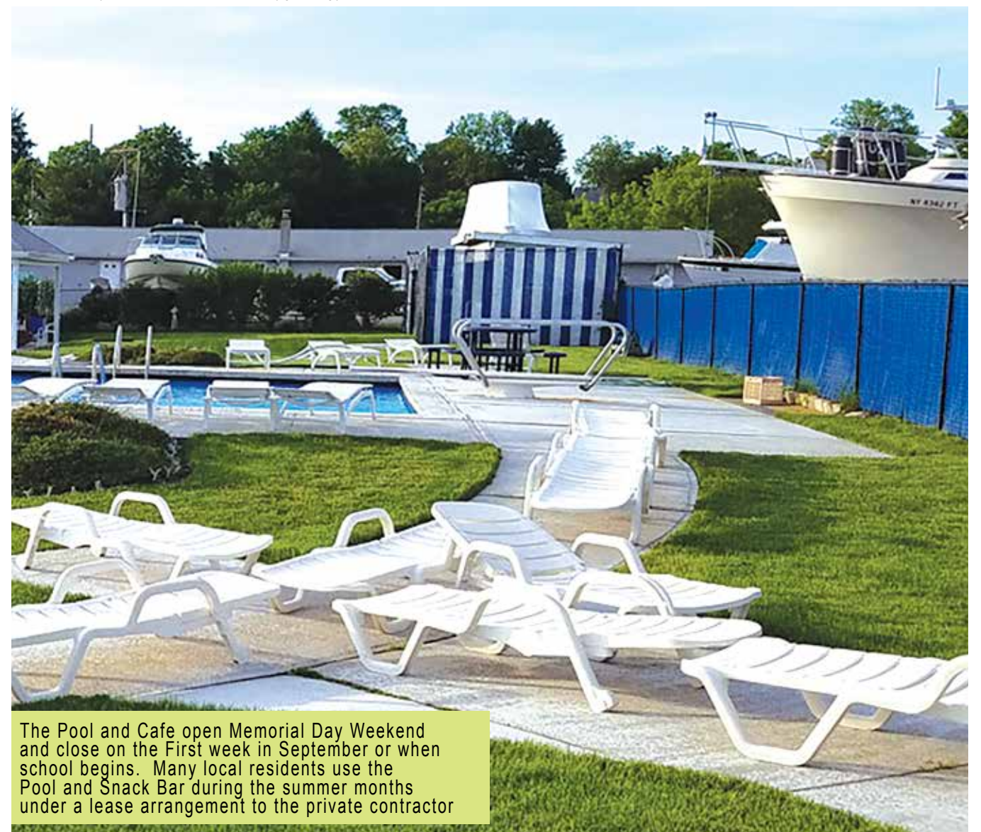
The Pool and Cafe open Memorial Day Weekend and close on the First week in September or when school begins. Many local residents use the Pool and Snack Bar during the summer months under a lease arrangement to the private contractor