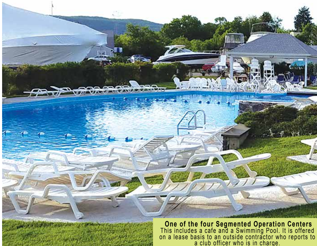
One of the four Segmented Operation Centers This includes a cafe and a Swimming Pool. It is offered on a lease basis to an outside contractor who reports to a club officer who is in charge.