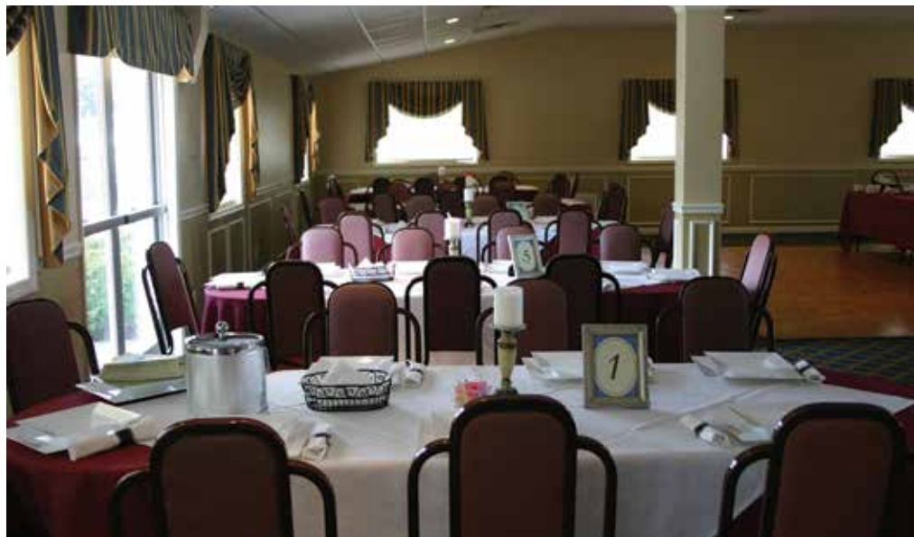
The Clubhouse. The top floor of the Clubhouse is used by the members for their meetings. The main floor and the kitchen are leased out to outsiders for weddings, showers, and other events. This operation is controlled by a member who is responsible for the entire operation.