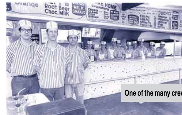
One of the many crews over the years.

Hard to believe but many, many folks remember days like this at "Jumpin Jacks"