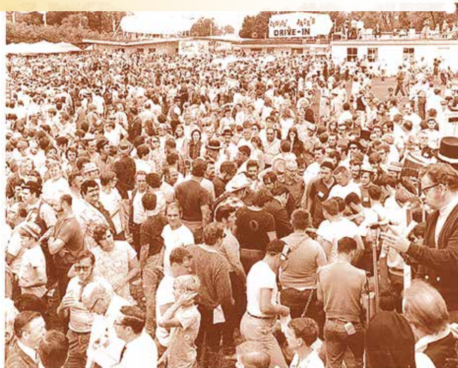
Fantastic crowd at "Jumpin Jacks"

For 65 years 'Jumpin Jacks', located on the banks of the Mohawk River, in Scotia, NY has been the "place to go" when you wanted that special hot dog, hamburger, fish dinner or a frozen drink!